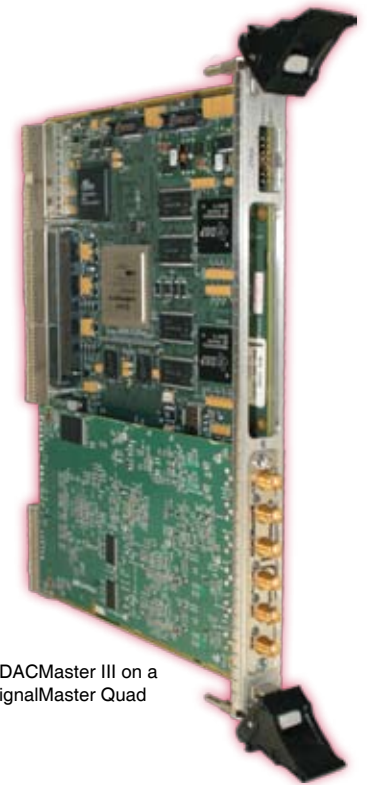
ADACMaster III on a SignalMaster Quad

The BSDK and MBDK of the SignalMaster Dual and SignalMaster Quad include the necessary software to transfer data between the carrier's FPGAs and the ADACMaster III. They also come with DSP APIs (for BSDK users) and blocksets (for MBDK users) to control the ADACMaster III's parameters.